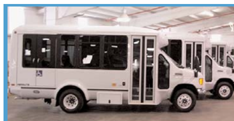
2006 Eldorado-National buses ready for delivery to the Arkansas State Highway & Transportation Department. These are the first four buses of 100 buses ordered by the Arkansas State Highway & Transportation Department and sold by Ward Transportation Services, Inc., Conway, Arkansas.

"Arkansas will always be a special place to me "